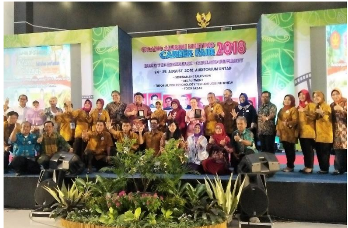
Tadulako University, Indonesia