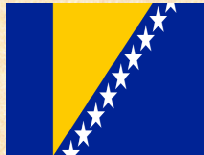
Bosna & Herzegovina